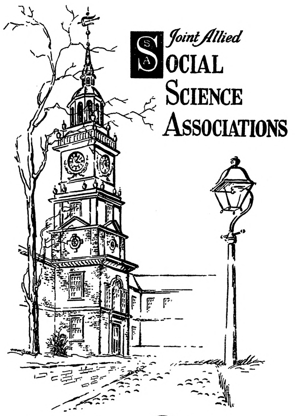
Annual Meetings Philadelphia 1957